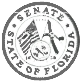
Bill Galvano President of the Senate